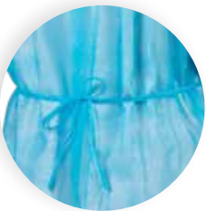
Ties at the Back