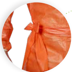
Ties at the Side